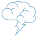
BRAINSTORMING & IDEATION

MindManager complements your workday to synthesize that information, boost your productivity, empower your plans & projects, and collaborate & communicate more effectively.