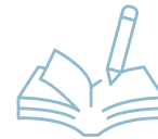
PROCESS DESIGN & DOCUMENTATION